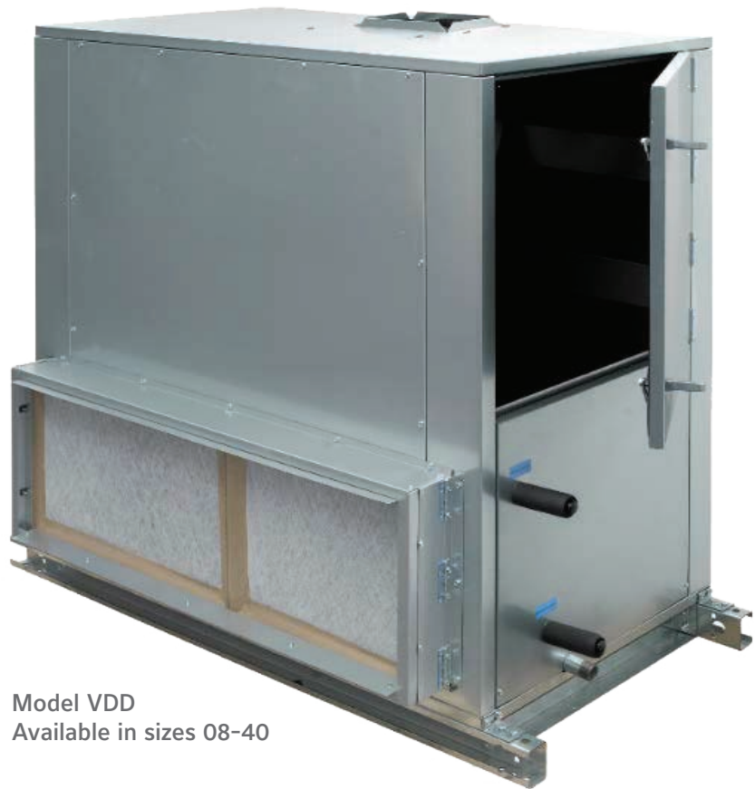
Model VDD Available in sizes 08-40